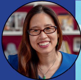
by Caldecott honoree Grace Lin!

Storytelling Math books show that all children can be mathematical thinkers. Stories feature children of color using math as they play, build, and discover the world around them. Includes activities for families to do together. Storytelling Math goes beyond counting and shapes to explore concepts that all young children need for later school success. COMING FALL 2020.